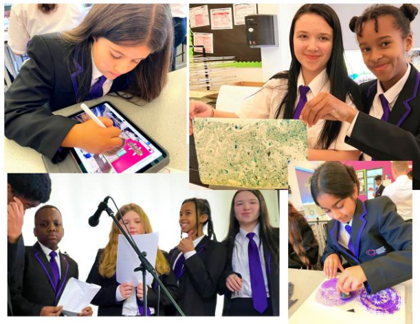
Year 7 students used creative arts and shadow-puppet performance to raise awareness of / tackle type 2 diabetes