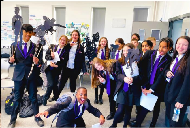
Year 7 students used creative arts and performance to raise awareness of / tackle type 2 diabetes