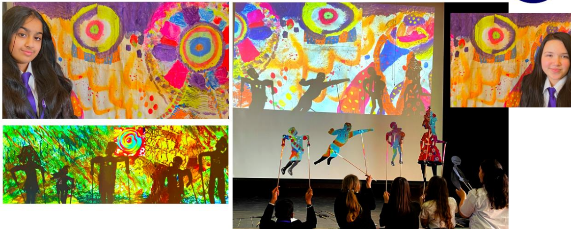
Year 7 students used creative arts and performance to raise awareness of / tackle type 2 diabetes